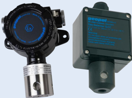
Geopal GJ-C Gas detector for Installation in non-classified areas